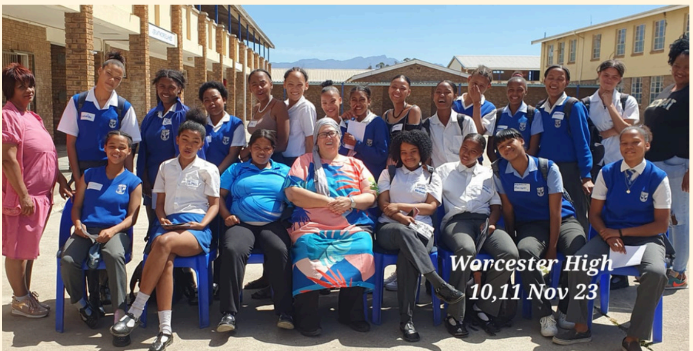
TEENAGE PREGNANCY PREVENTION TRAINING AT WORCESTER HIGH SCHOOL WITH GIRLS FROM GRADES 8 TO 11